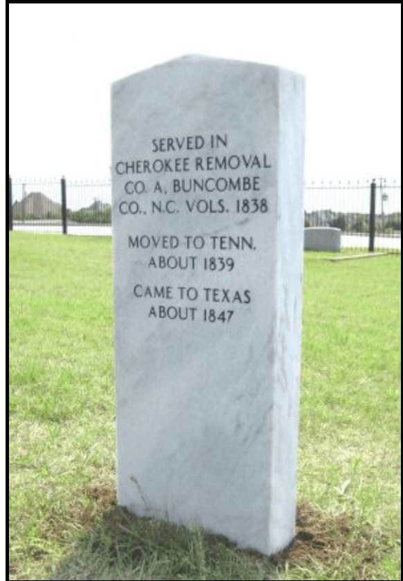
Front and back of headstone installed in White's Chapel Cemetery on Saturday, May 9, 2009.