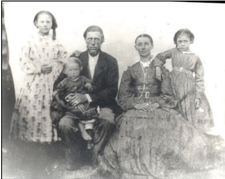
Photo taken in Walker County, Georgia about 1867